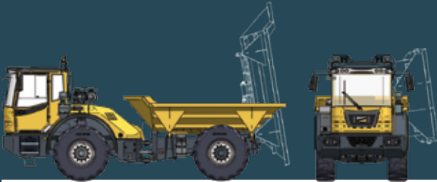
C815s Three-way dumper

What features do you need for your Bergmann?