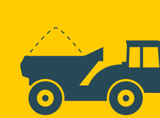
Conventional compact tipper