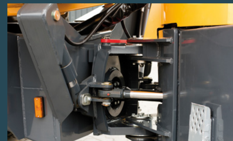
Articulated swivel joint with stabilization cylinder.

Good access to all maintenance points with the patented hood system.