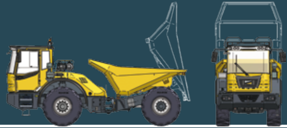
C815s Rear tip dumper