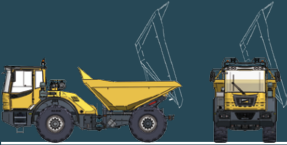
C815s Swivel-tip dumper

Moves the most, regardless of the type of bucket used.